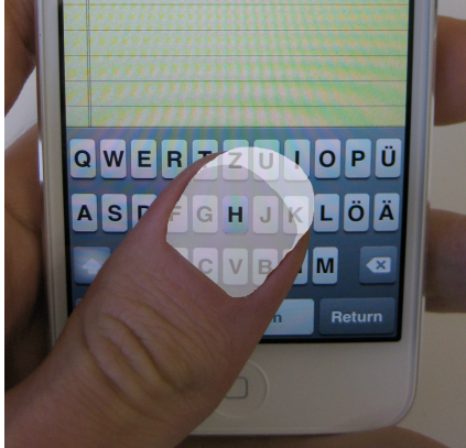
Figure 3: Simulating a transparent finger avoids fat-finger problems. The selected character is highlighted through the Finger Display.