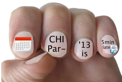
Figure 2: Aligning multiple fingers and selecting a nail with the thumb expands the item, here a calendar event, to all fingers to reveal more information and controls.

In addition to notifications, fingernail displays can show up to five different control items at the same time (Fig. 1 d-e). These always-at-hand controls can simplify and speed-up common interactions. For example our