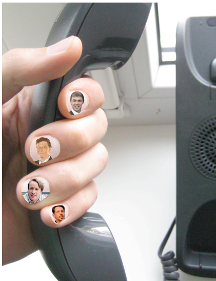
Figure 5: In-situ information, here the most frequently called contacts, is shown when physical objects are grasped.

permanently available at your fingertip, providing remote status output and input possibilities. For example a volume-widget can be grabbed from a physical loudspeaker or a music app on a computer device. The widget remains interactive and controls the volume without the need of walking to the speaker. Other possible widgets include light switches, thermostats or checking the current status of a washing machine that is located in the basement.